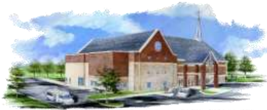
STAPLES MILL ROAD BAPTIST CHURCH

These Gospel-centered opportunities provide a platform for you to share the Good News and serve people from Virginia and beyond. Please complete a connection card if you are interested in serving. For more information, visit sbcv.org/blesspetersburg .