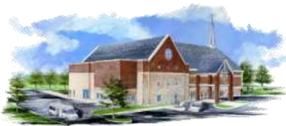
STAPLES MILL ROAD BAPTIST CHURCH