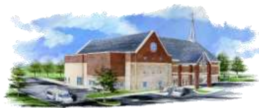
STAPLES MILL ROAD BAPTIST CHURCH

Thank you for your support to this important ministry!