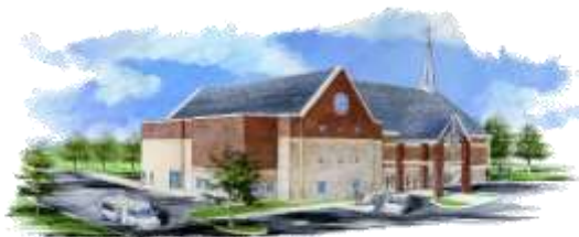
STAPLES MILL ROAD BAPTIST CHURCH

Thank you for your support to this important ministry!